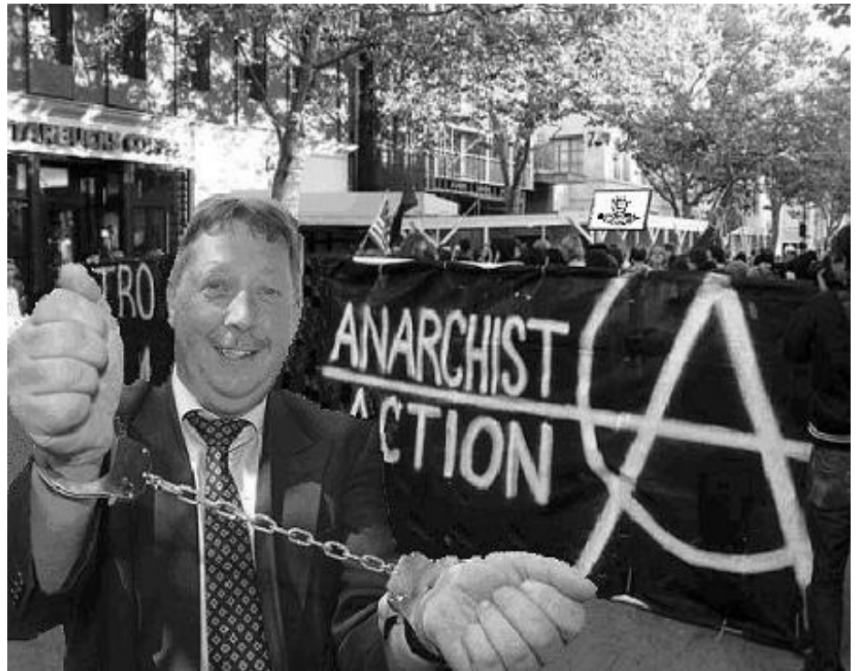
In a parallel universe Sammy Wilson is taken away for 'carbon recycling' by Warzone members

There is also a new social centre in Galway and some details can be found here: www.galwayspace.org . Meanwhile comrades in Leeds are having difficulties with the local council authorities who could literally close down their autonomous centre, The Common Place, over refusal of an entertainment licence. Info and petition can be found here: http://www.thecommonplace.org.uk/index.php?page=home . Show your solidarity!