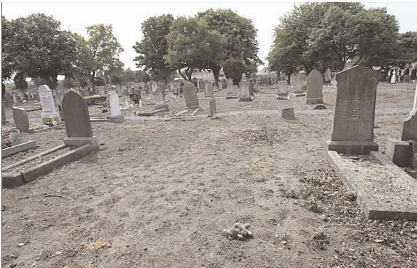
Location of initial Bethany 33 graves discovered in Mount Jerome Cemetery, Dublin - see WWW.BETHANYSURVIVORS.COM