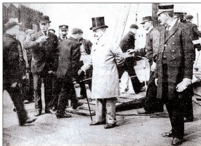
Irish born Thomas Barnardo sees boys off to Canada

According to a 3 August 2010 letter to me from the Secretary to the Minister for Justice, in 1945 the then Minister designated Bethany Home as a place of detention for female Protestant children and young persons. It functioned as a reformatory. I have since enquired where Protestant males were sent. I also asked if the Minister for Education, who controls access to the redress scheme for victims of institutional abuse, from which Bethany residents are excluded, had been informed.