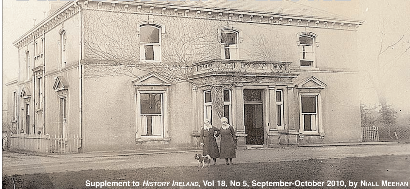
Supplement to HISTORY IRELAND , Vol 18, No 5, September-October 2010, by NIALL MEEHAN