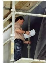
The Bogside Artists at work.

burgeoning throughout with facts this is one book no student of Irish affairs or visitor to Ireland can do without. The book as a reflection of the lives of the artists in their own words is itself an historical document offering unique insights into a very unique place - Derry, N. Ireland. It has many rare photos, the most splendid of which are of the famous murals themselves. You will learn where they came from, what inspired them, how they were actually painted and the histories associated with them. You will learn too how N. Ireland, despite its size and location, sits squarely in an epoque of global political conflict and radiates with many of the democratic and spiritual issues that animated it.